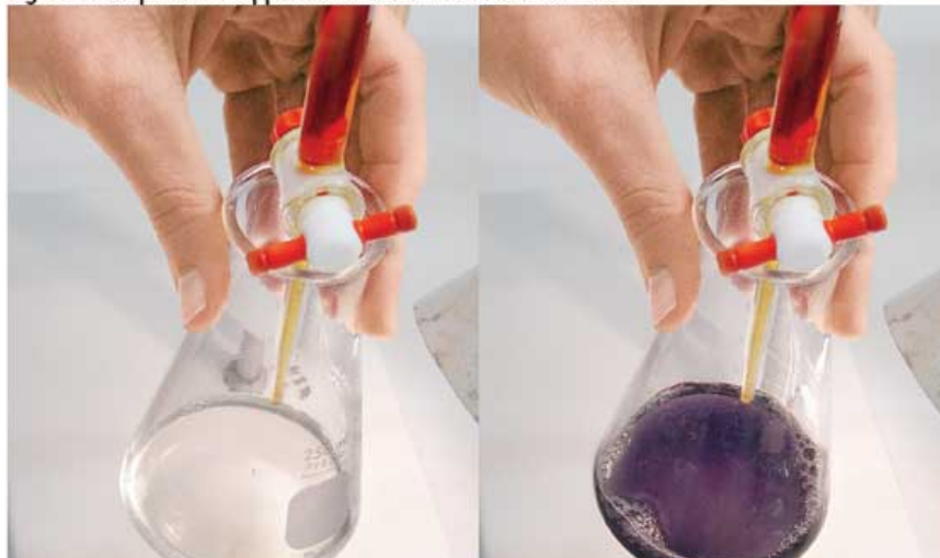
Figure V: Endpoints of Ripper titration for white and red wines