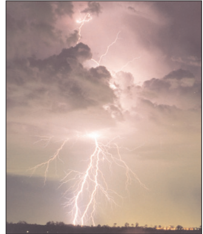
Lightning, a natural plasma spectacle, is a challenge to understand.

Lightning was striking the Earth long before human life began, and may even have played a crucial role in the evolution of life on our planet. Around the globe, lightning lights up the sky fifty to one hundred times per second, and while not every lightning bolt reaches the ground – about 75% of lightning discharges remain in the clouds – each year in the United States alone lightning hits the ground about twenty-five million times. While there are clearly negative aspects to such strikes, there are also unwarranted concerns and even positive aspects. Although lightning can sometimes cause significant damage, especially for unprotected people and objects, the number of people killed by lightning is small compared with other accidental causes of death. And although each commercial aircraft is struck by lightning on average once a year, it is not a significant hazard since today's airplanes are designed to handle such strikes without serious problems. Furthermore, over 30% of all electric power line failures and many forest fires are lightning-related. It is worth mentioning, however, that lightning-initiated forest fires play an important role in the natural life cycle of forests.